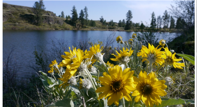
"The Lake" (Fishtrap Lake in this case :)